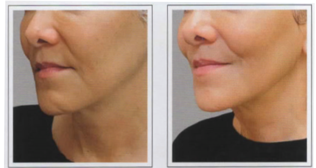
A Youthful Glow