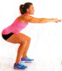
SQUAT/CALF RAISE Squat, then stand tall, lifting heels to shift weight to balls of feet. Lower to start.

Perform 3 sets of 15 repetitions per move for stronger, smoother legs.