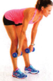
DUMBBELL DEADLIFT Holding dumbbells, hinge at hips, keeping legs straight. Return to start.

Head to prevention.com/cellulite-fix for the full workout.